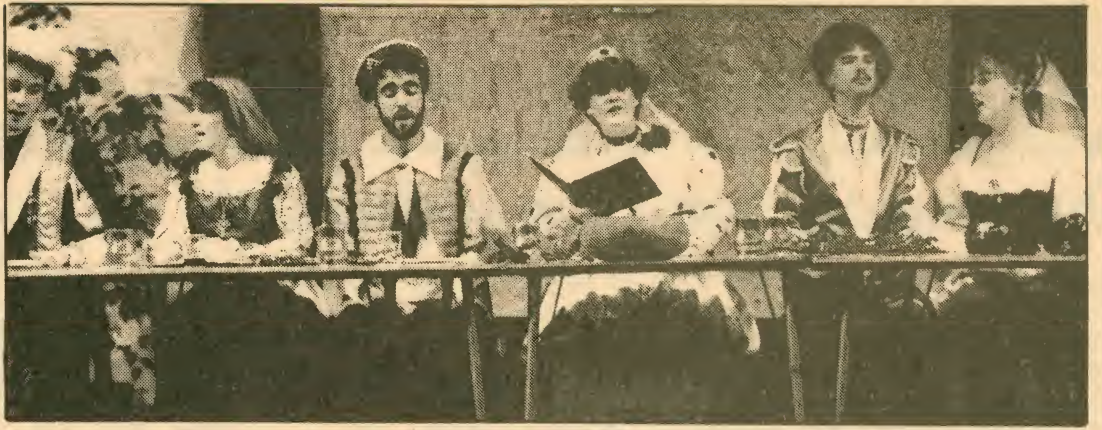
Choral members in rehearsal for this weekend's Madrigal Dinner performances in Heacock Commons.